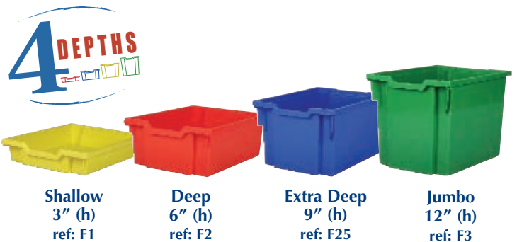
Shallow 3" (h) ref: F1 Deep 6" (h) ref: F2 Extra Deep 9" (h) ref: F25 Jumbo 12" (h) ref: F3

The material used to make the trays has been chosen for quality and safety. For quality the trays are made from 20% talc filled Polypropylene giving strength and rigidity. For safety Polypropylene is chemically resistant to the majority of chemicals used in schools and semi fire-retardant at 0.87" per min. There is also an anti-static additive in the Polypropylene to reduce the attraction of dust.